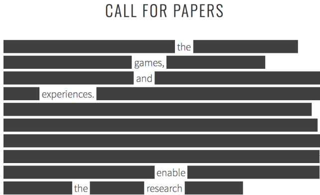
Figure 2: An erasure poem generated by running blackout on one paragraph of the 2019 PCG Workshop call for papers, taking the form of a simple declarative sentence.